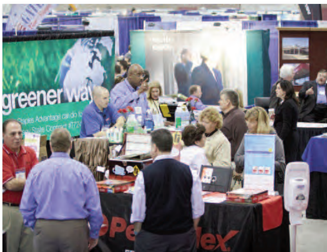
Exhibit at the largest municipal conference in the country—the League’s Annual Conference is held in November at the Atlantic City Convention Center. Over 1,000 exhibit booths and 800 companies converge to present their products and services to 19,000 attendees. For more detailed information on exhibits, visit NJLM’s homepage at www.njslom.org and click on the link for “Annual Conference”.

Kristin Lawrence, (609) 695-3481 ext. 125 klawrence@njslom.com