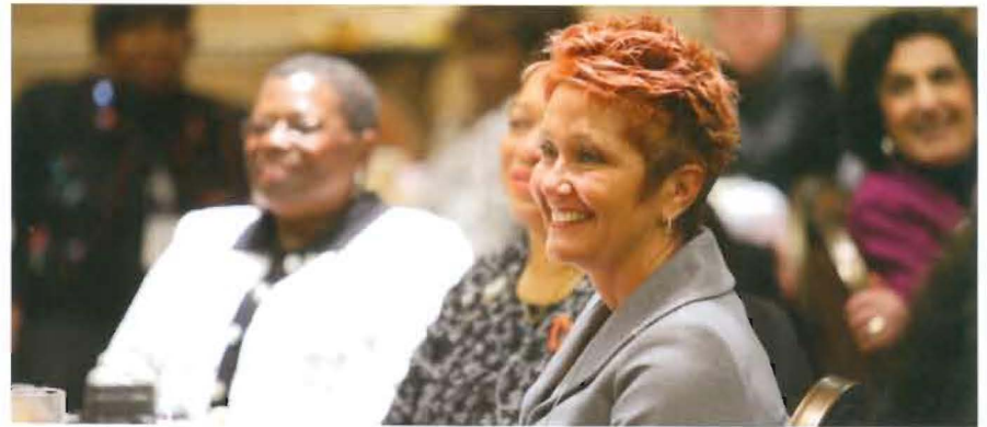
Attendees enjoy the Women in Government Breakfast on Thursday.