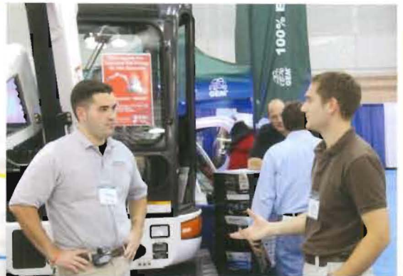
The exhibit hall included many displays of heavy equipment.