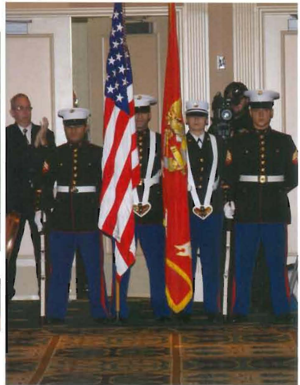
The Marine Color Guard presents the flags.