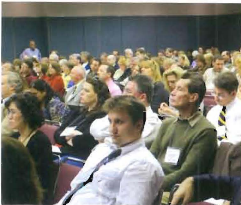
League sessions were well-attended.