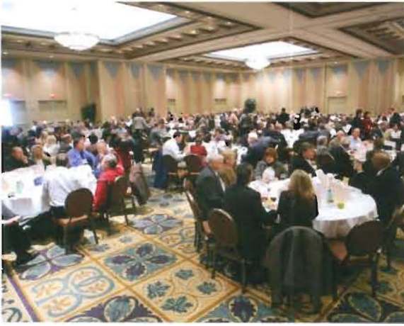
Mayors and other elected officials attend the Mayor's Box Luncheon on Wednesday.