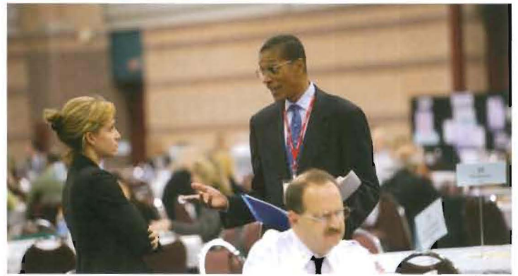
Conference-goers visit the Consulting Period on Tuesday Afternoon. Over 80 different state agencies and non-profit groups were represented.