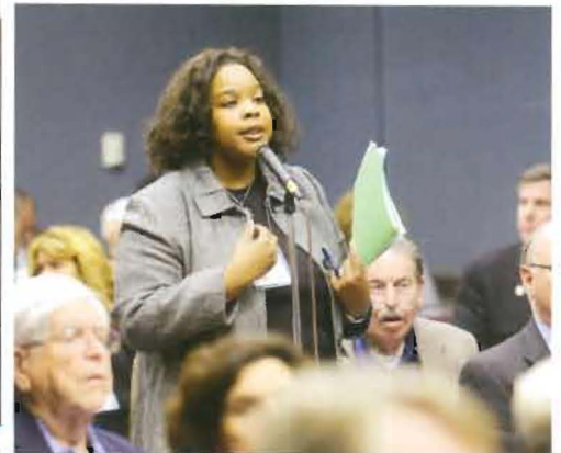
A delegate asks a question during the Resolutions Committee Meeting on Tuesday.