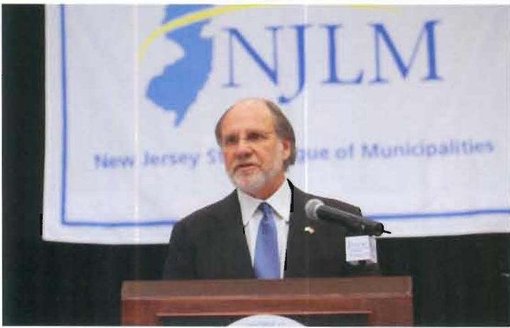
Governor Jon Corzine addresses the current economic crisis during the League Luncheon.